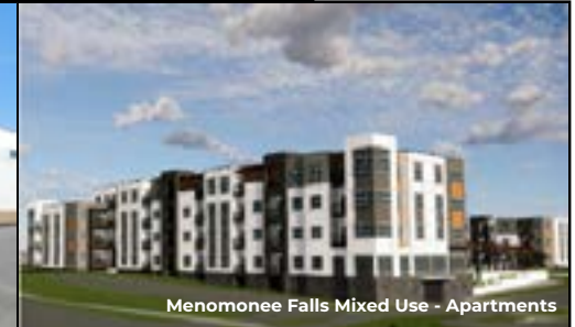
Menomonee Falls Mixed Use - Apartments