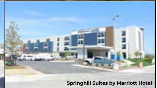
Springhill Suites by Marriott Hotel