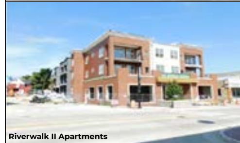
Riverwalk II Apartments