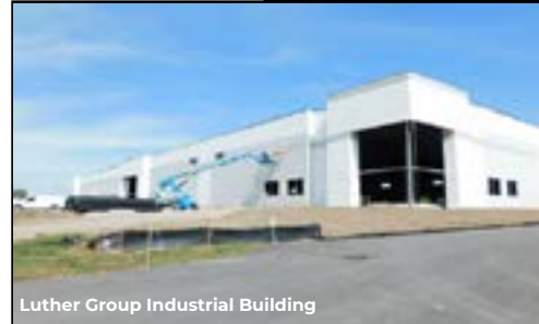
Luther Group Industrial Building