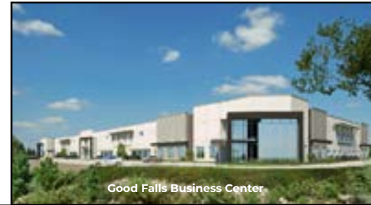
Good Falls Business Center

Construction is proceeding on a 120 unit apartment development located at the southeast corner of the intersection of Marcy Road and Silver Spring Drive in southern Menomonee Falls.