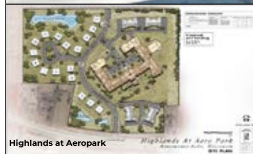
Highlands at Aeropark