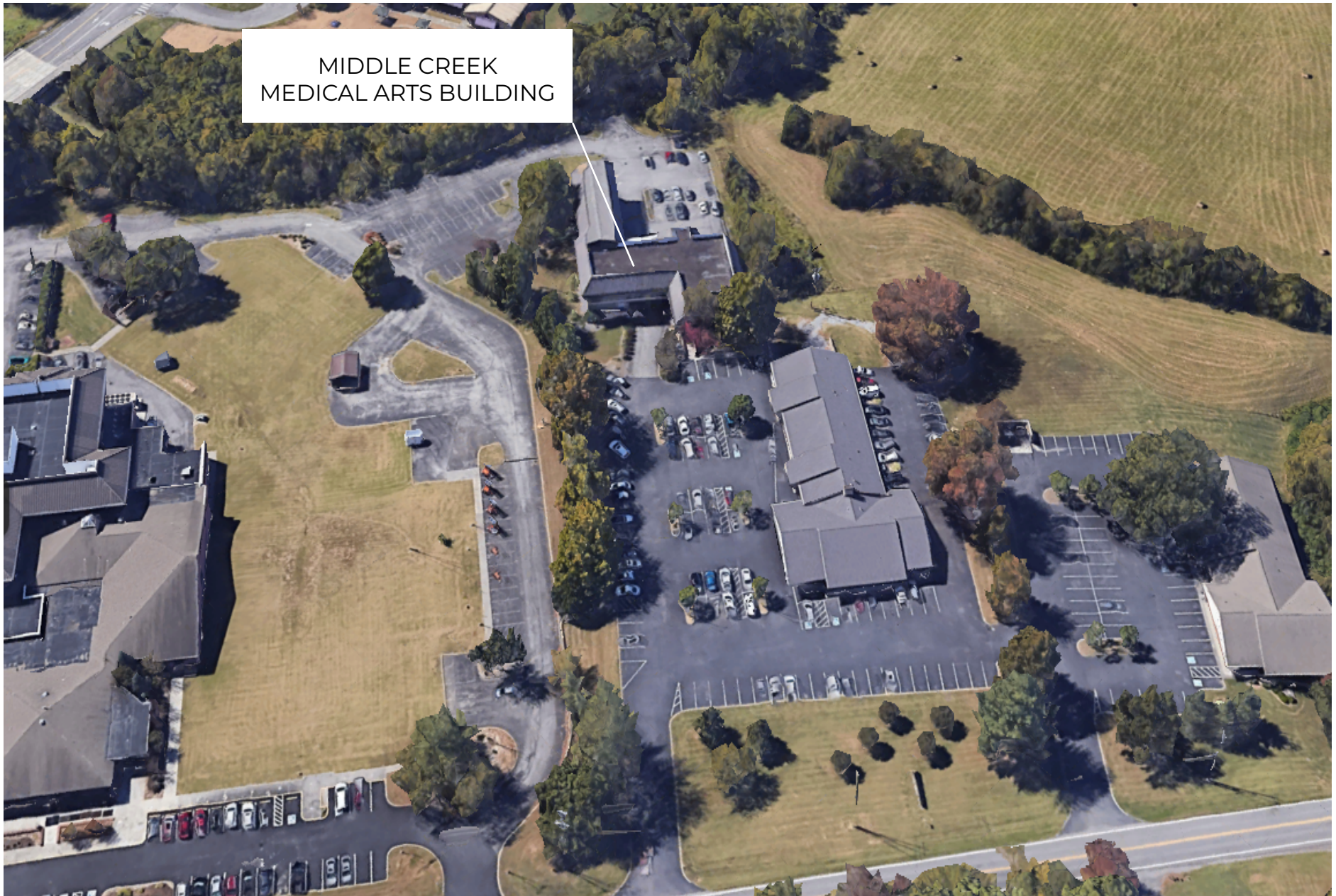
MIDDLE CREEK MEDICAL ARTS BUILDING